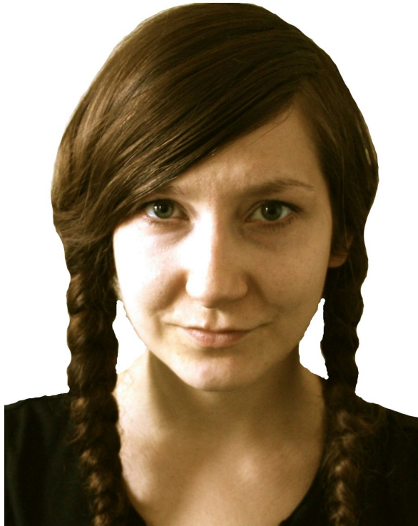
PHOTO OF ARTIST